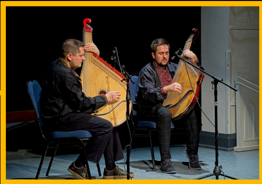
BANDURALICIOUS (DECEMBER 19, 2025)