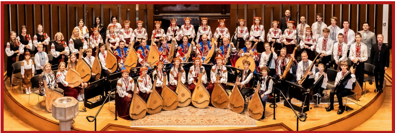
FIRST BIENNIAL TORONTO BANDURA FESTIVAL (OCTOBER 25, 2025)

The primary mission of TBF is to establish a biennial bandura festival featuring bandura performances and a biennial bandura music competition in Toronto, Ontario, and to host various bandura-related musical concerts and events throughout the year.