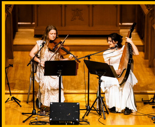
DIVKA (MAY 30, 2025)