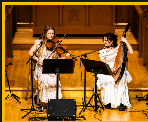
DIVKA (MAY 30, 2025)