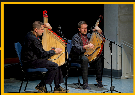
BANDURALICIOUS (DECEMBER 19, 2025)